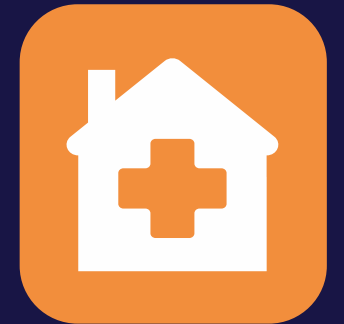
On site medical clinic