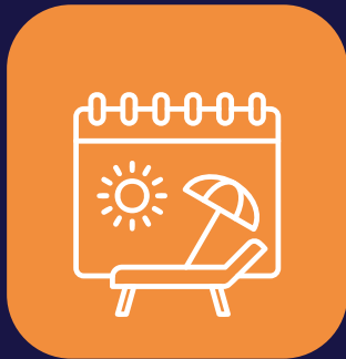
Paid time off