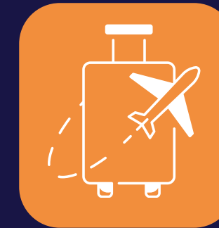
Travel assistance program