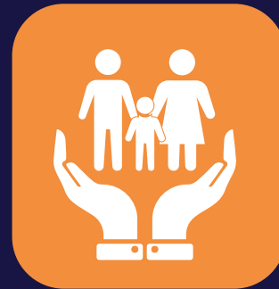
Company paid life insurance