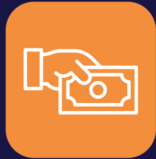
Paid time off