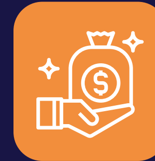
Paid Time Off